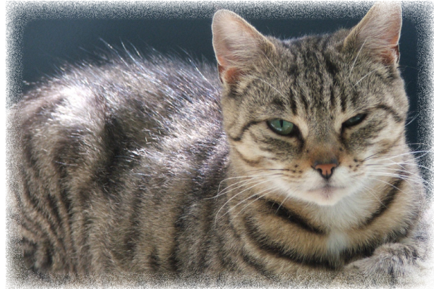
Lucas after the ISPCA took him in

Lucas is a young cat surrendered to an ISPCA inspector. Lucas was being kept in a small, dirty cage with a number of other cats. Their constant crying and miaowing alerted neighbours and their plight was reported to the National Animal Cruelty Helpline on 1890 515 515.